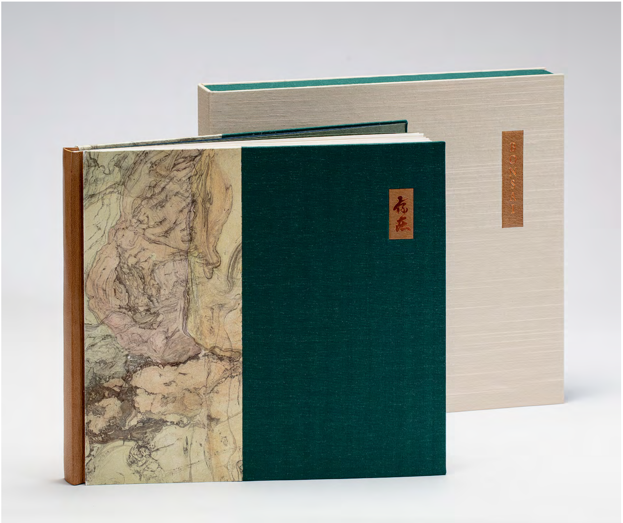
A Bonsai-Shaped Mind & Postures of the Heart • Deluxe Edition • $2,800