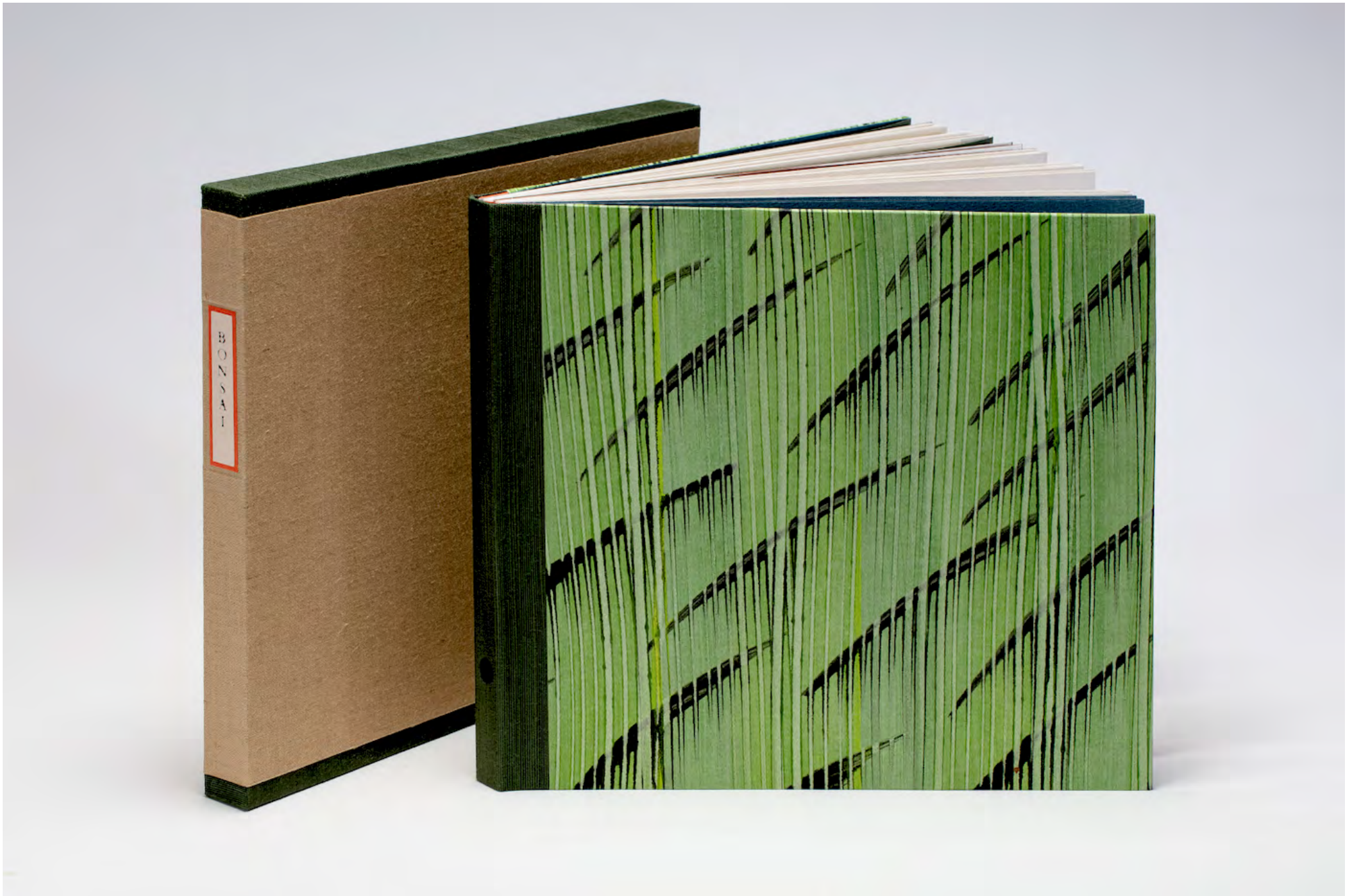
A Bonsai-Shaped Mind & Postures of the Heart • Slipcase Edition • $1,950