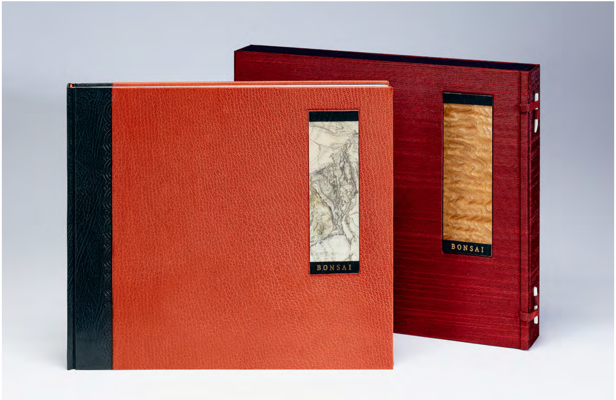
A Bonsai-Shaped Mind & Postures of the Heart • Engraver's Edition • $4,400